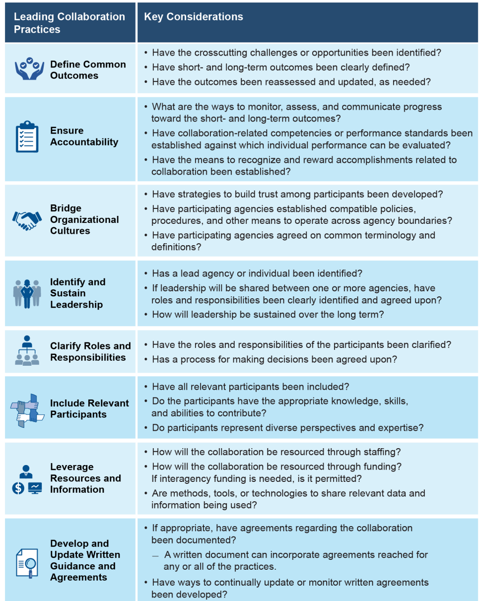
Figure 3: Leading Interagency Collaboration Practices and Key Considerations

GAO-25-107636