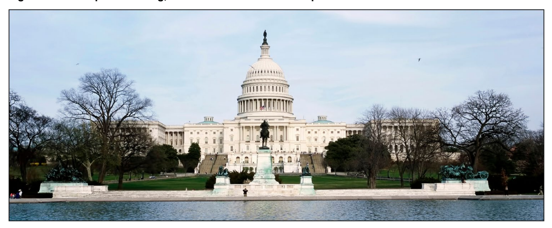
Figure 1: U.S. Capitol Building, where the U.S. House of Representatives Assembles

GAO-25-107428