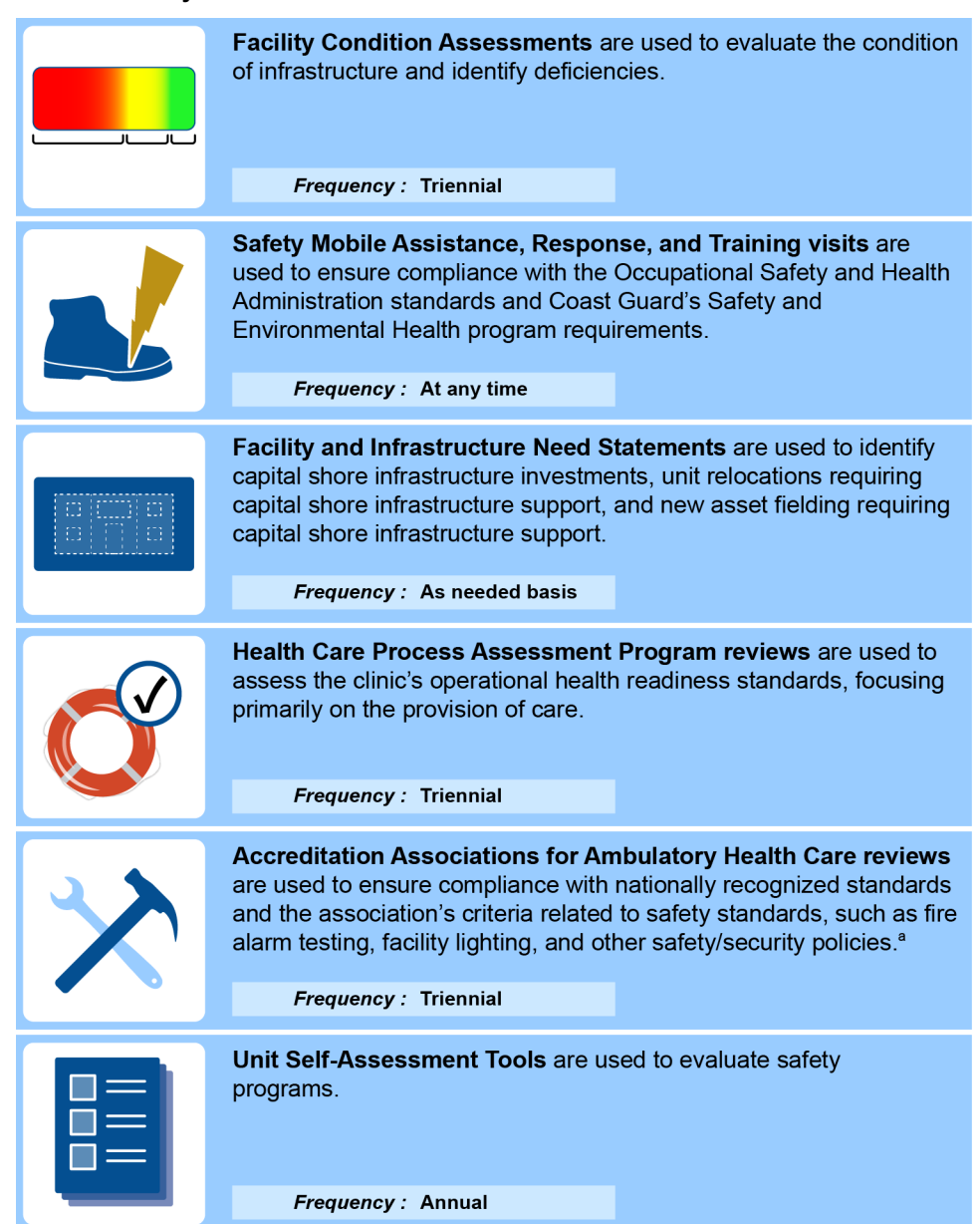
Figure 6: Types and Frequency of Condition Assessments for Coast Guard's Clinics and Ashore Sickbays

GAO-25-107073