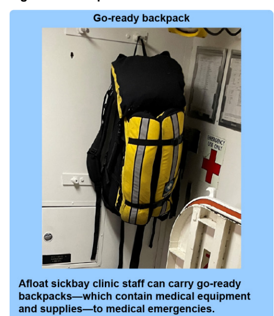
Figure 3: Examples of Coast Guard Medical Equipment on an Afloat Sickbay