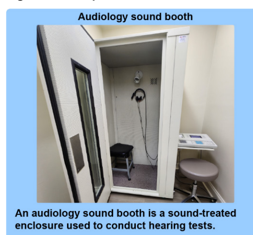
Figure 2: Examples of Coast Guard Medical Equipment at Clinics