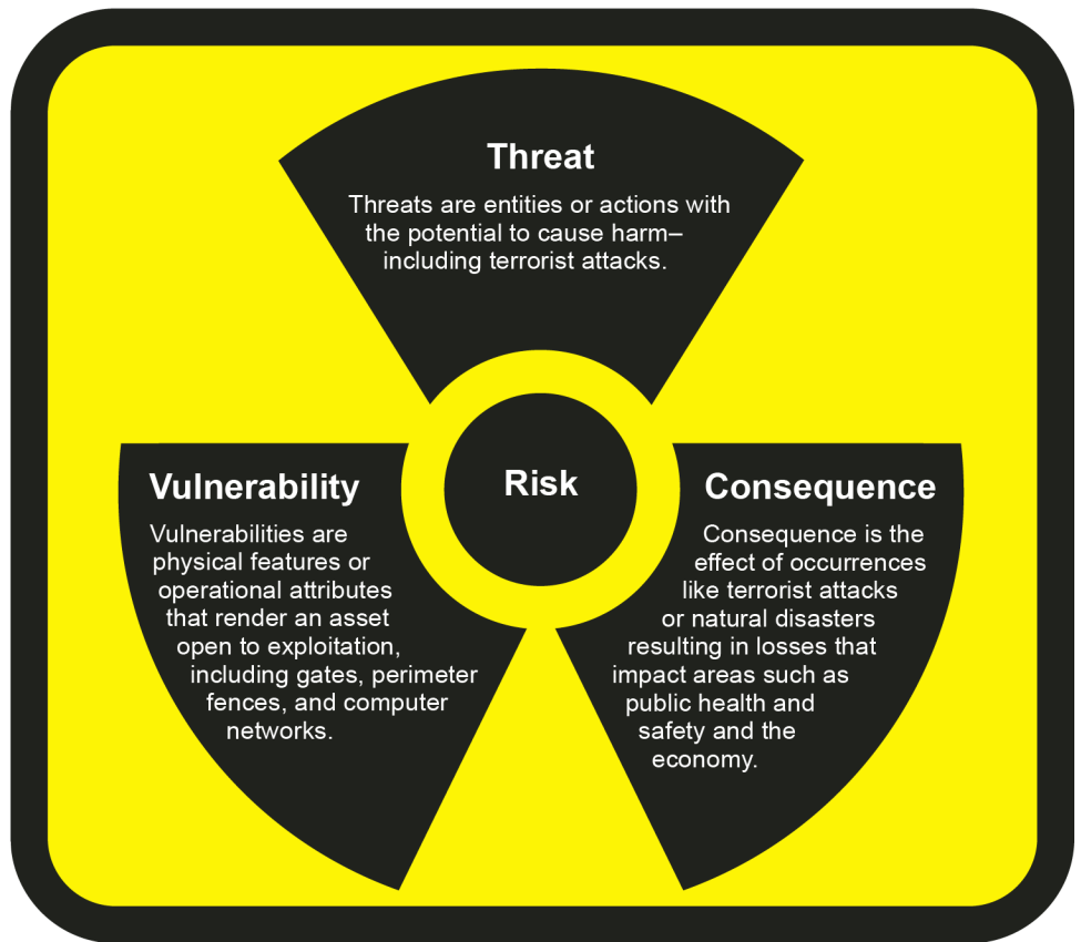
Figure 1: The Three Elements of Radioactive Material Risk

Source: GAO analysis of Department of Homeland Security information. | GAO-24-107014