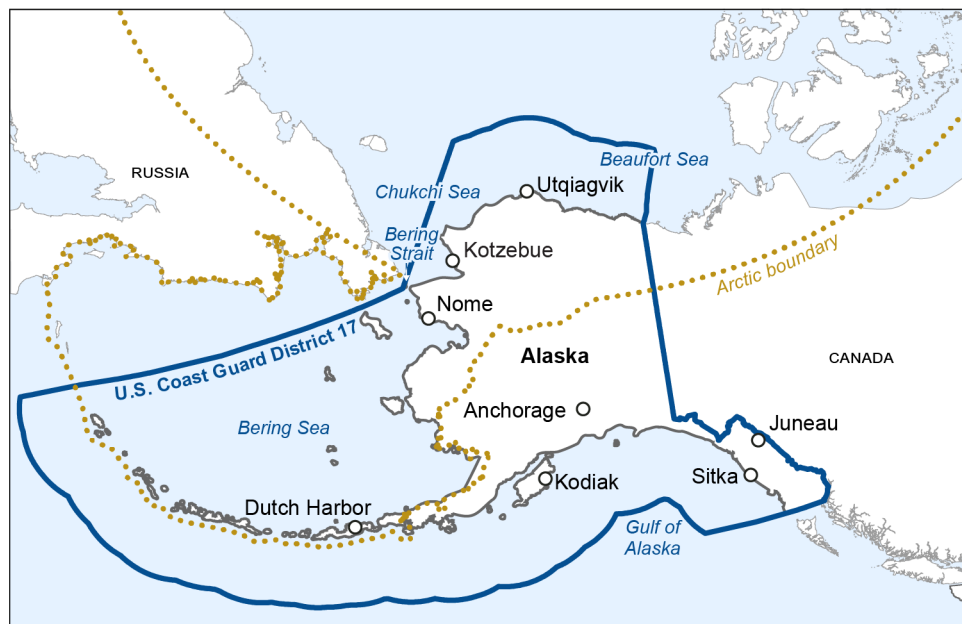
Figure 1: Map of Coast Guard District 17 Area of Operations and Associated Arctic Boundary

Source: U.S. Census Bureau, U.S. Coast Guard, Arctic Research Commission, Statistics Canada, UN Office for the Coordination of Humanitarian Affairs (map data). | GAO-24-106491