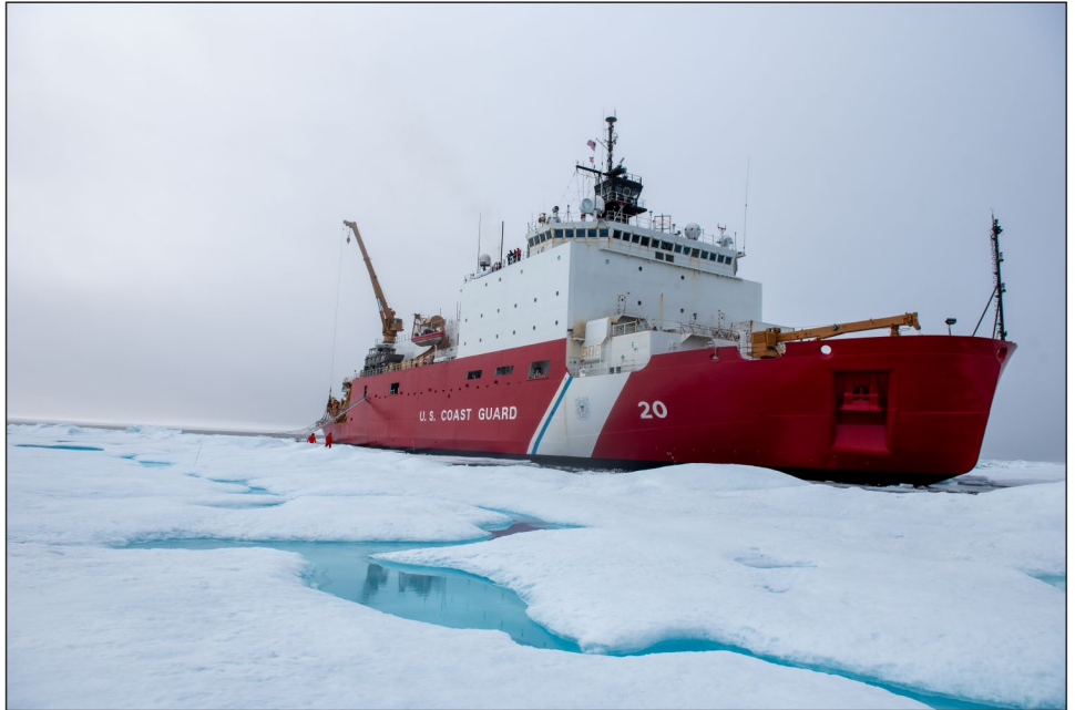
Figure 2: Coast Guard Polar Icebreaker Healy

GAO-24-106491