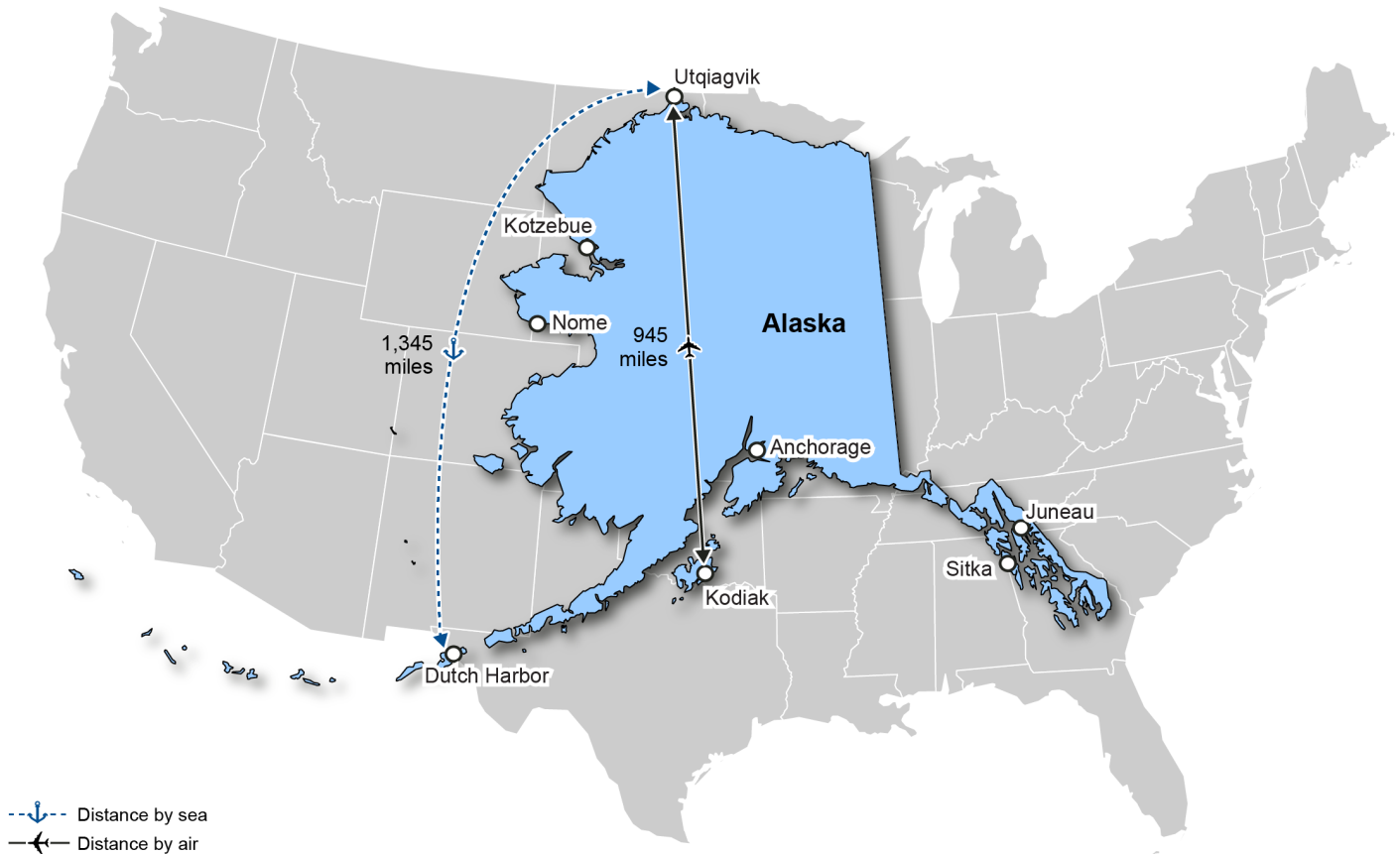
Figure 3: Air and Sea Travel Distances in Alaska

Sources: GAO analysis of National Oceanic and Atmospheric Administration and U.S. Coast Guard information, Map Resources (map). | GAO-24-106491