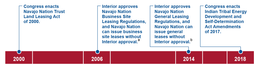
Figure 2: Timeline of Certain Laws and Regulations Pertaining to Leases of Navajo Nation Tribal Lands

The Navajo Nation's leasing regulations describe lease requirements and provide for an environmental review process by the Navajo Nation, as required by the Trust Leasing Act. Figure 2 shows the timeline of relevant legislation and Interior's approvals of Navajo Nation leasing regulations.