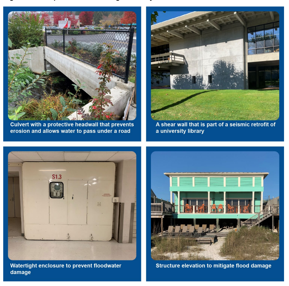
Figure 2: Examples of Hazard Mitigation Projects