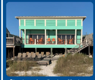
Structure elevation to mitigate flood damage