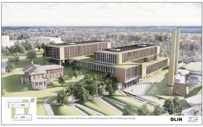
Figure 2: Cybersecurity and Infrastructure Security Agency (CISA) Building Preliminary Design Concept

| GAO-22-105970