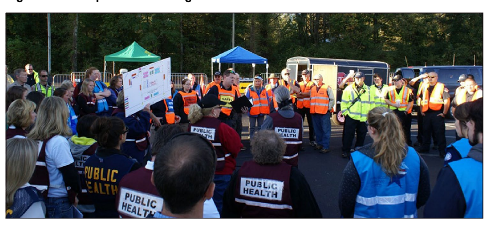
Figure 1: Participants in a Biological Incident Exercise

federal partners. Figure 1 shows participants gathering for a biological incident exercise.