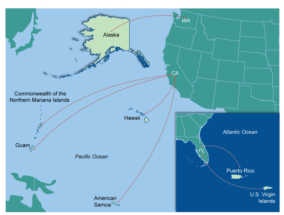
Figure 1: Map of Noncontiguous States and Territories Where Domestic Oceangoing Carriers Transport Cargo

GAO-22-105391