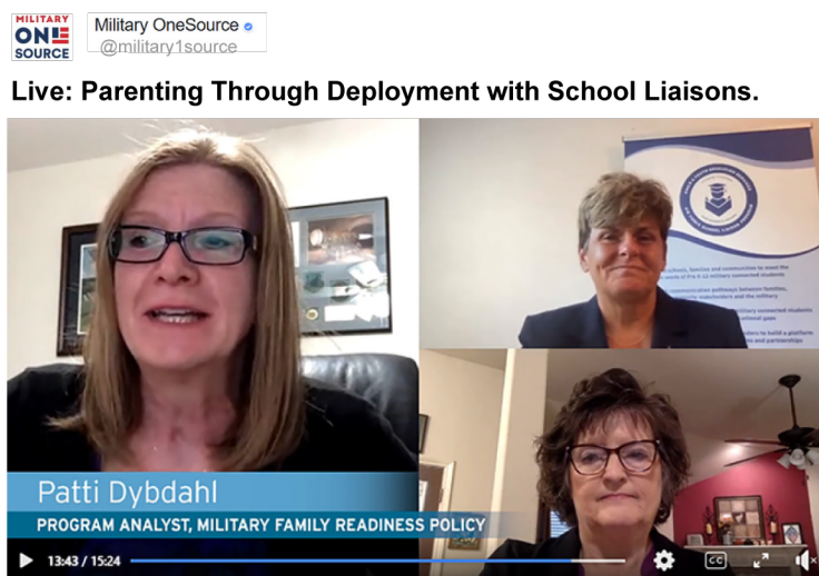
Figure 3: Image from Military OneSource Social Media Event Highlighting the School Liaison Program

Source: Department of Defense (DOD), Military OneSource ( www.militaryonesource.mil ) | GAO-22-105015