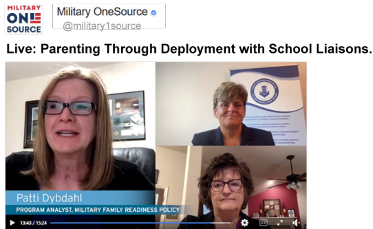
Figure: Image from Military OneSource Event Highlighting the School Liaison Program

GAO-22-105015