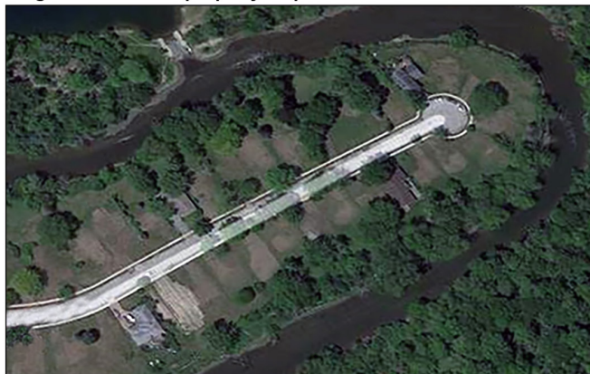
Neighborhood after property acquisitions

The City of Des Plaines received FEMA grants in 2015 and 2019 to acquire and demolish about 25 homes. The city maintains services and utilities for the remaining homes in the neighborhood.