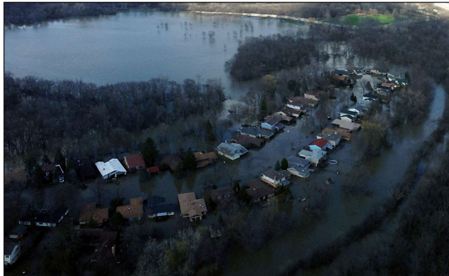
Neighborhood during 2013 flood

In April 2013, the neighborhood suffered severe flooding.