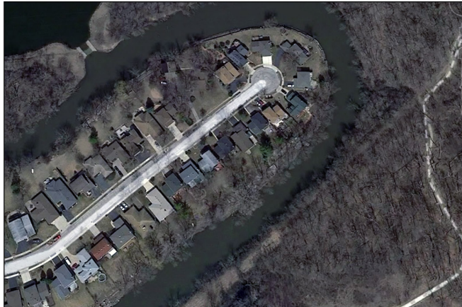
Neighborhood before 2013 flood

A neighborhood in Des Plaines, Illinois, was surrounded on three sides by a river.