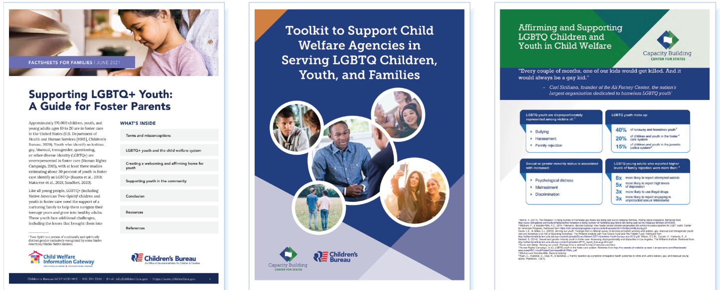
Figure 2: Examples of Administration for Children and Families Publications Related to Working with Lesbian, Gay, Bisexual, Transgender, and Queer or Questioning (LGBTQ+) Youth and Families