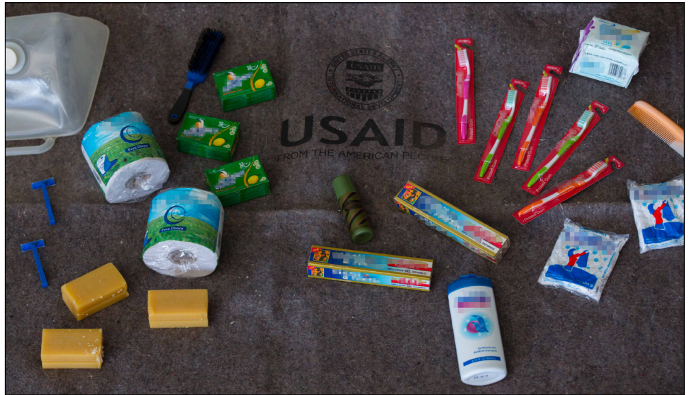
Figure 4: Examples of Emergency Relief Supplies Provided by USAID

Source: U.S. Agency for International Development (USAID). Photo credit: Ellie Van Houtte, USAID. | GAO-22-104431