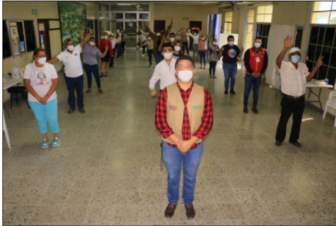
Figure 3: Volunteer Training in Honduras Using Personal Protective Equipment and Social Distancing

GAO-22-104431