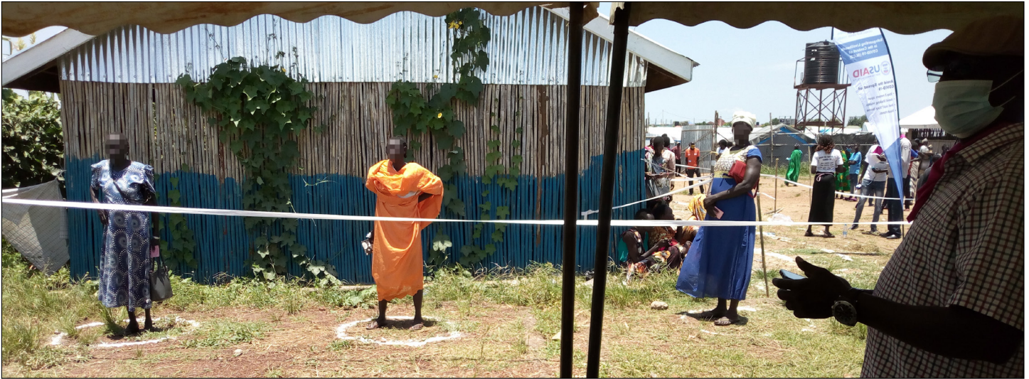
Figure 1: Socially Distanced Cash Distribution in South Sudan

Source: Catholic Relief Services – United States Conference of Catholic Bishops. | GAO-22-104431