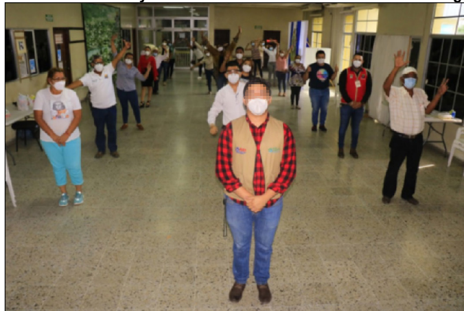
Masked and Socially Distanced Humanitarian Assistance Training in Honduras

Source: Global Communities. | GAO-22-104431