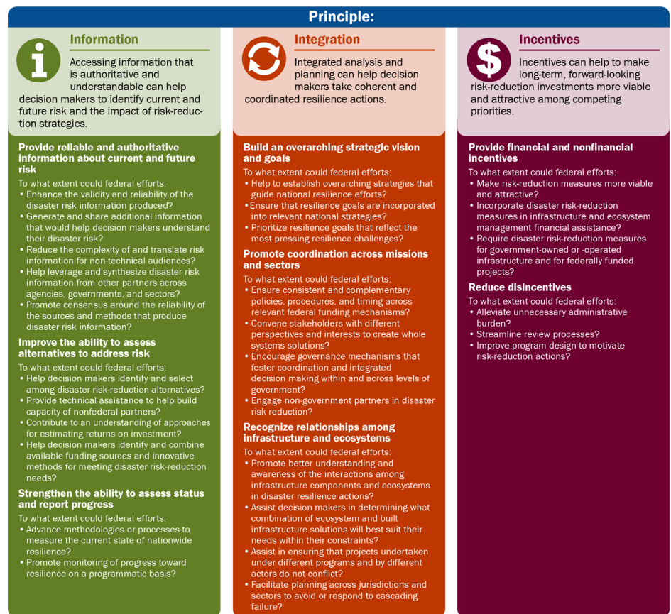
Figure 3: Principles of GAO's Disaster Resilience Framework

As shown in figure 3, this framework is organized around three broad, overlapping principles and a series of questions that those who provide oversight or management of federal efforts can consider when analyzing opportunities to enhance their contribution to national disaster resilience.