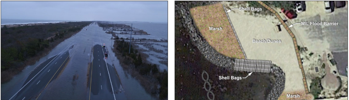
Figure 2: Flooding (Left) and Resilience Enhancements Made (Right) on Delaware State Route 1

Photo is from 2017 and the rendering was published in 2018. | GAO-21-561T