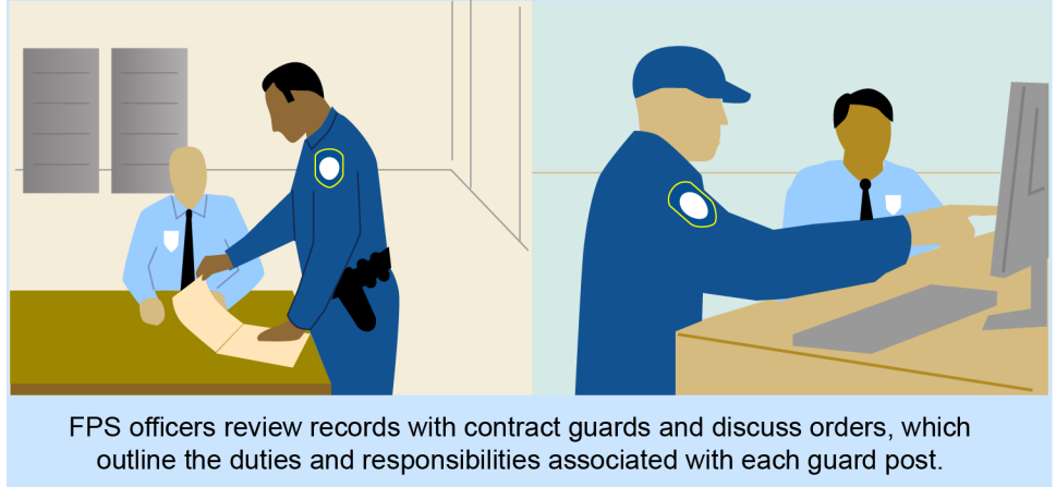
Figure 2: Federal Protective Service's (FPS) Oversight of Contract Guards

FPS officers review records with contract guards and discuss orders, which outline the duties and responsibilities associated with each guard post.