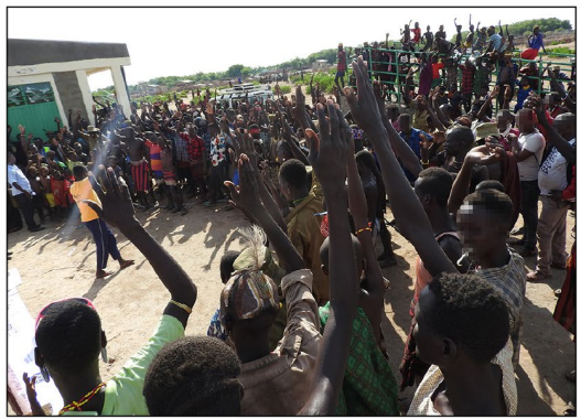
Community members at a roadshow, pledging commitment to vaccinate livestock annually and avoid eating or sharing meat from sick or dead animals.

Source: Tegegne Shiferaw, MPH, BSc. | GAO-21-359