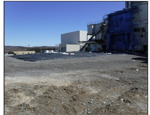
After demolition, September 2018