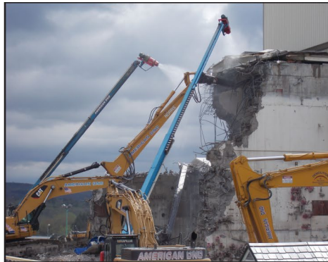
During demolition, June 2018