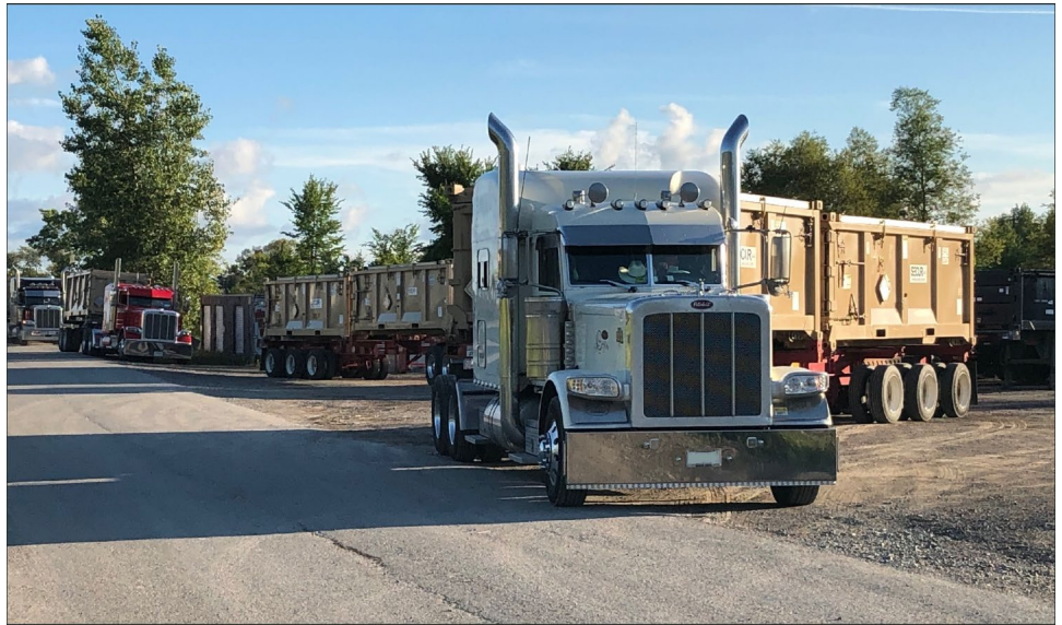
Figure 3: Low-Level Waste from the West Valley Demonstration Project Being Transported for Off-Site Disposal, August 2020

Source: West Valley Demonstration Project. | GAO-21-115