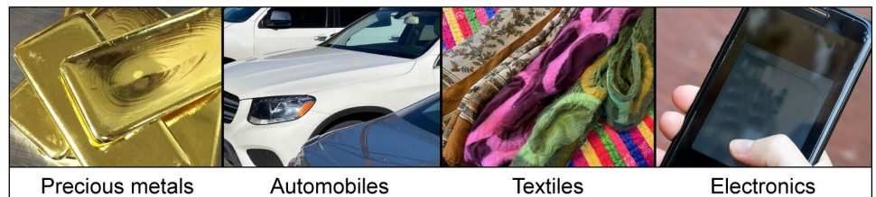
Figure 3: Examples of Goods Commonly Used in Trade-Based Money Laundering Schemes

According to information from different U.S. agencies, international bodies, and partner countries, criminal and terrorist organizations use a wide variety of goods in TBML schemes, but HSI analysis has found the most common items are precious metals, automobiles, clothes and textiles, and electronics (see fig. 3). As of 2018, HSI reported that approximately 70 percent of its TBML-related casework involved these four types of goods. However, criminal and terrorist organizations use any number of different goods in TBML schemes. For example, U.K. government officials told us about a scheme involving the misrepresentation of dental equipment as books in a series of exports from the United States to the United Kingdom.