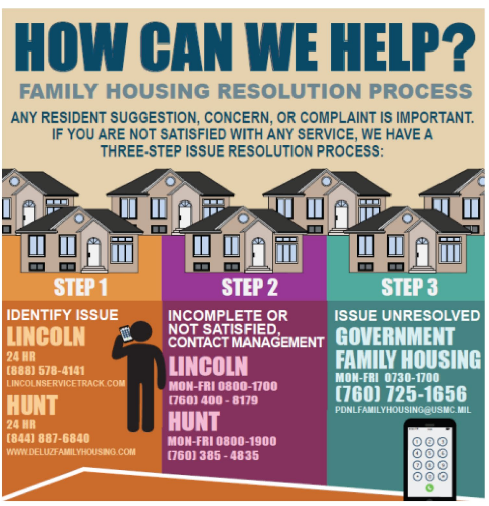
Figure 6: Flyer Advertising Marine Corps' Three-Step Dispute Resolution Process

name from the "Residential Communities Initiative Housing Office" to the "Garrison Housing Office" to more clearly denote that the military housing office is not associated with the private partner. In addition, a Marine Corps housing office official provided us with a flyer, which is distributed to residents by the private partner, informing residents of housing office contact information and the service's three-step dispute resolution process. See figure 6 for a copy of the flyer.