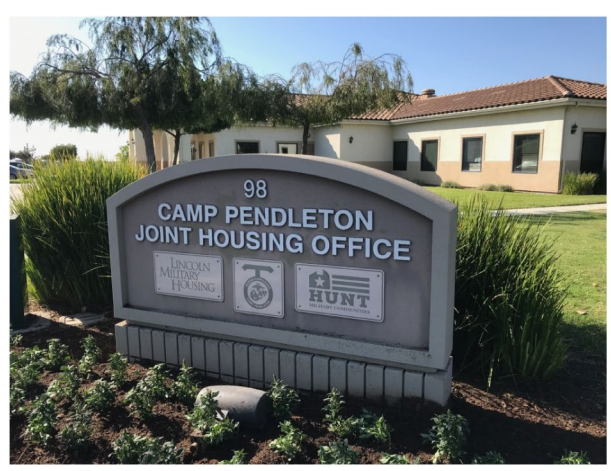
Figure 5: Examples of Varying Levels of Detail in Military Housing Office Signage

physical co-location and unclear building signage. For example, a military housing office official at Fort Bragg, North Carolina, told us the military housing office was the best kept secret on the installation. Moreover, residents that participated in our four focus groups at Fort Bragg expressed confusion in differentiating the Army military housing office officials from private partner representatives. Similarly, officials at the military housing office at Tinker Air Force Base, Oklahoma, told us that many residents were confused by their office's role because the private partner office goes by the name "Tinker Housing Office." Further, we observed that both private partner representatives and some military housing office officials are located in the same building, and signage does not distinctly indicate that the office houses both military officials and private partner representatives. In contrast, the military housing office at Camp Pendleton, California, is intentionally branded as the "Camp Pendleton Joint Housing Office" and signage indicates the office houses officials from both the Marine Corps and the installation's private partners. See figure 5 for examples of the varying level of detail in military housing office signage.