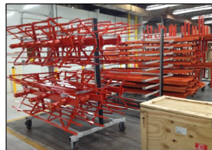
Spare antennas at a Federal Aviation Administration warehouse