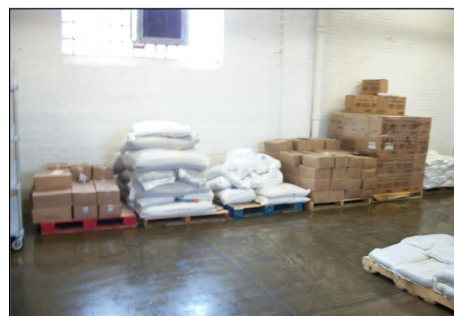
Non-perishable food in a food services warehouse at United States Penitentiary Leavenworth