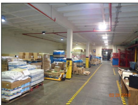
Interior of a food services warehouse at Federal Correctional Institution El Reno