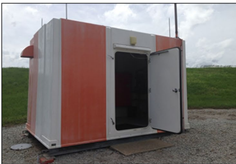
A shack that houses a medium-intensity approach lighting system with sequenced flashers at the Charles B. Wheeler Downtown Airport in Kansas City, Missouri