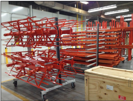
Spare antennas in the Logistics Support Facility at the Mike Monroney Aeronautical Center in Oklahoma City, Oklahoma