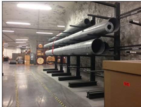
Components for wind shear alert system at the Staging Area in Independence, Missouri