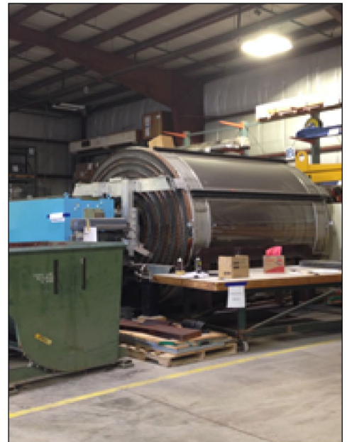
Out-of-use device that had been used in experiments and was being stored for eventual display in a warehouse at Fermi National Accelerator Laboratory