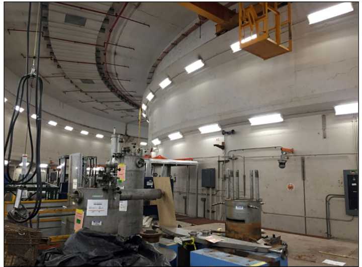
Interior of a warehouse at Argonne National Laboratory