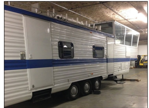
Mobile air traffic control tower at the Mobile Asset Deployment Center in Independence, Missouri