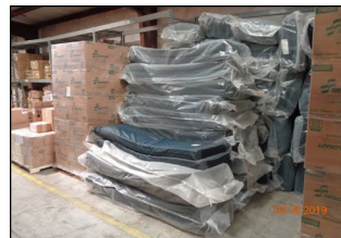
Inmate mattresses at a Bureau of Prisons warehouse