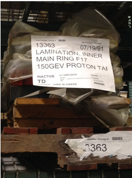
Spare equipment held as a replacement part since 1991 in a warehouse at Fermi National Accelerator Laboratory in Batavia, Illinois