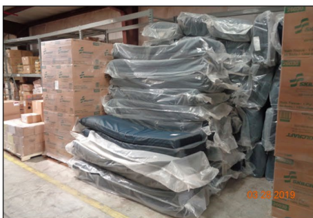
Mattresses for inmates in a warehouse at Federal Correctional Institution El Reno