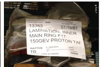
Spare equipment stored since 1991 at a Department of Energy Office of Science warehouse

GAO-20-228