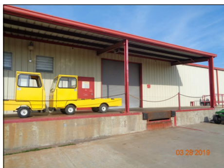
Exterior of a distribution center warehouse at Federal Correctional Institution El Reno in El Reno, Oklahoma