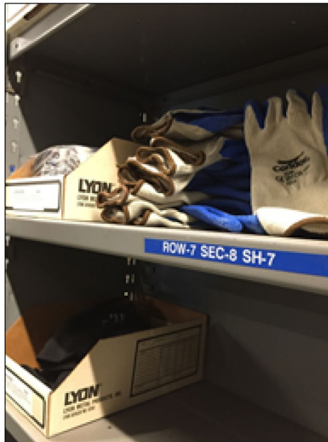
Gloves stocked in a warehouse for laboratory use at Fermi National Accelerator Laboratory