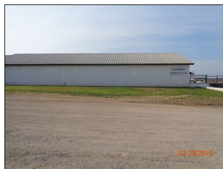
Exterior of a warehouse used to store dairy equipment and materials at Federal Correctional Institution El Reno