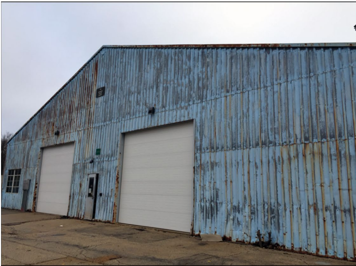
Exterior of a warehouse at Argonne National Laboratory in Lemont, Illinois