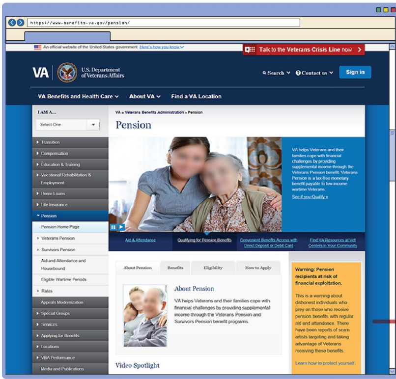
Figure 3: Warning about Risk of Financial Exploitation on Department of Veterans Affairs Website

Warning: Pension recipients at risk of financial exploitation. This is a warning about dishonest individuals who prey on those who receive pension benefits with regular aid and attendance. There have been reports of scam artists targeting and taking advantage of Veterans receiving these benefits. Learn how to protect yourself.