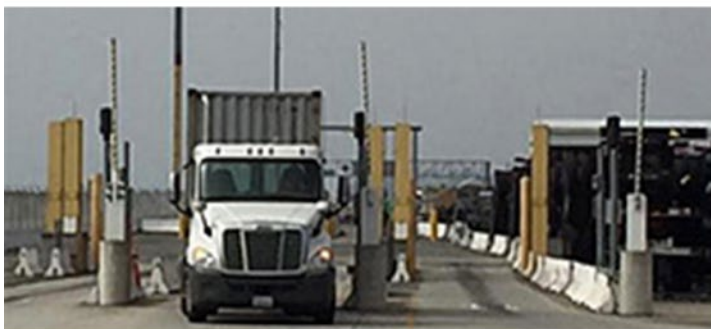
Figure 1: Management of Federal Technology and Science Programs

Management of Federal Technology and Science Programs – GAO also assess the management and coordination of federal research and development efforts, including investments in scientific facilities (such as telescopes and research vessels) and emerging technologies (like synthetic biology and quantum computing).