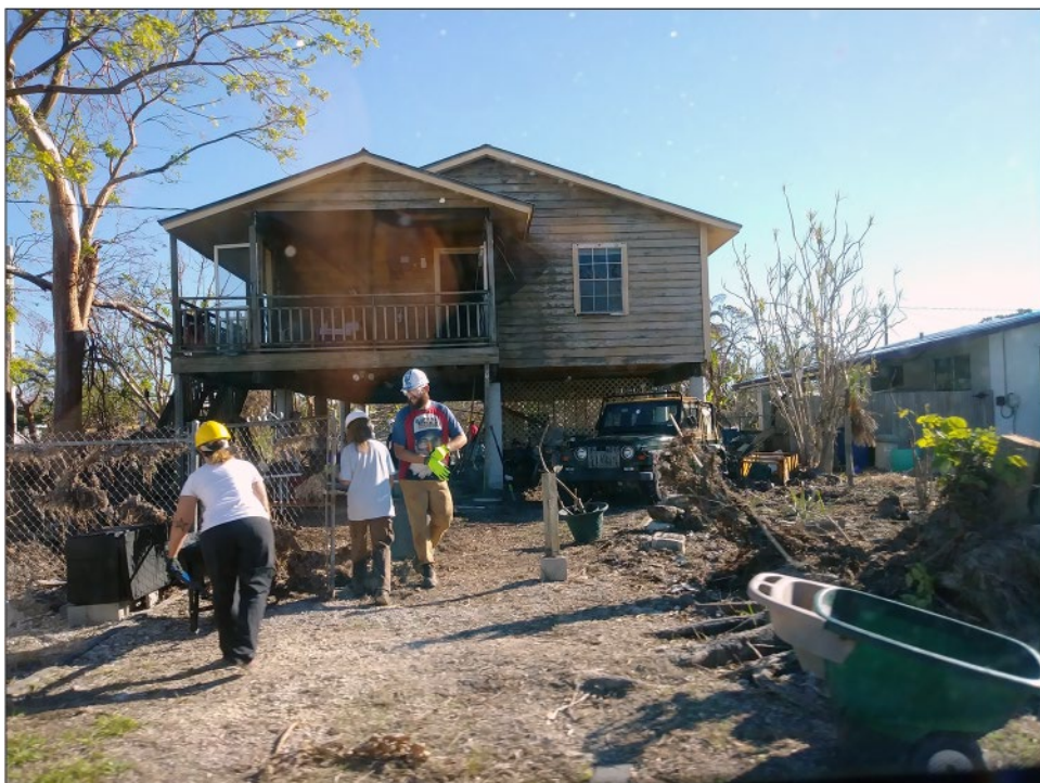
Figure 3: Nonprofit Volunteer Team Clearing Debris in Big Pine Key, Florida after Hurricane Irma

GAO will use all of the $14 million in disaster funds by the end of FY 2020. A complete list of the reports issued and audits currently underway is included as Enclosure II.