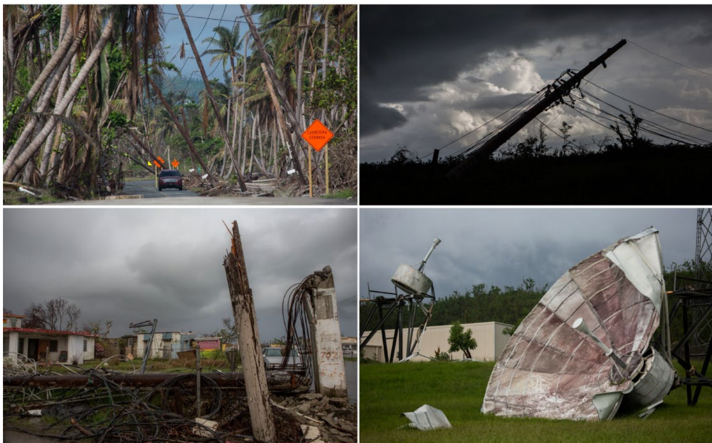
Figure 2: Damaged Power Lines and Satellite Dish in Puerto Rico after Hurricane Maria in November 2017

GAO-19-403T