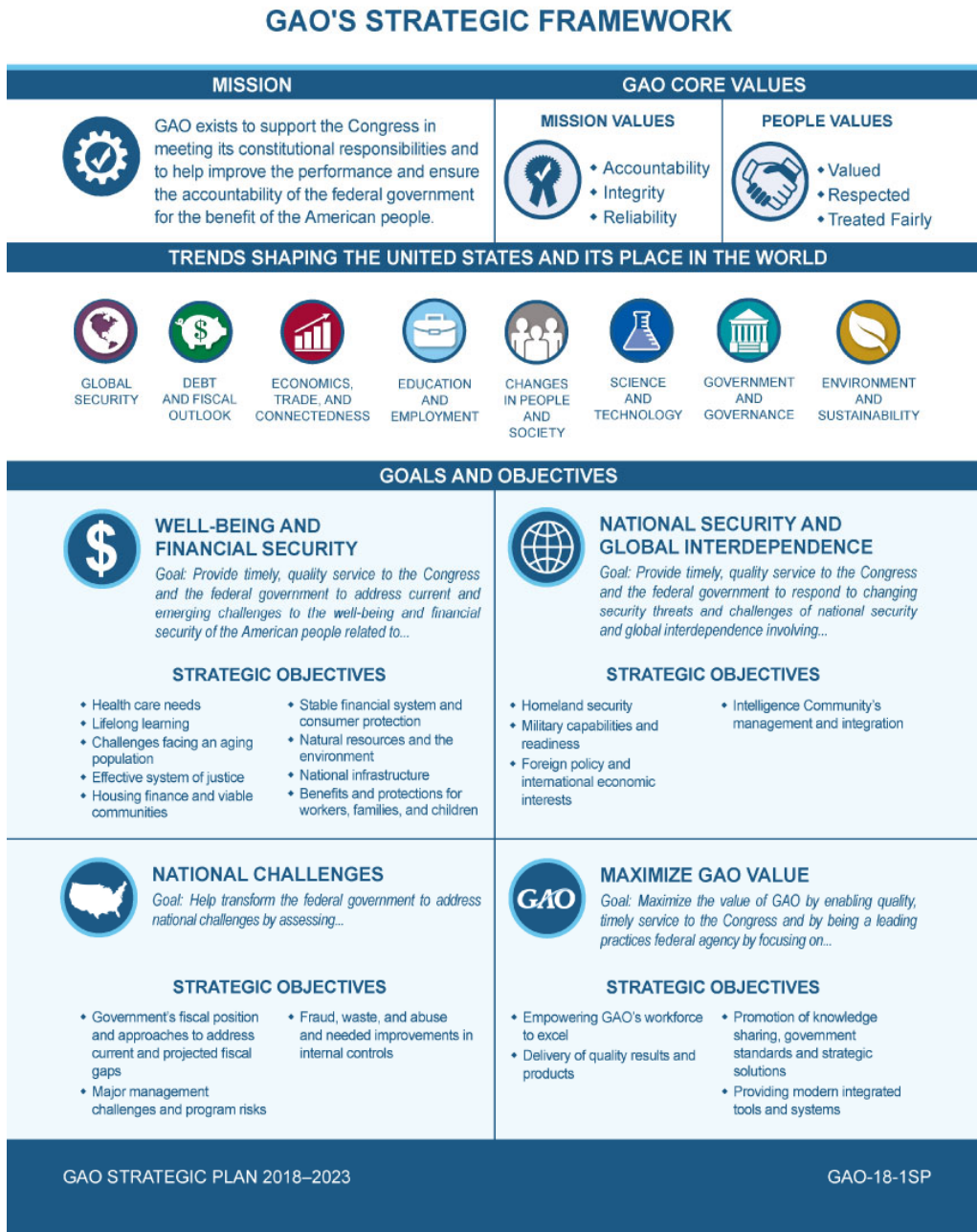
Figure 4: GAO’s Strategic Framework