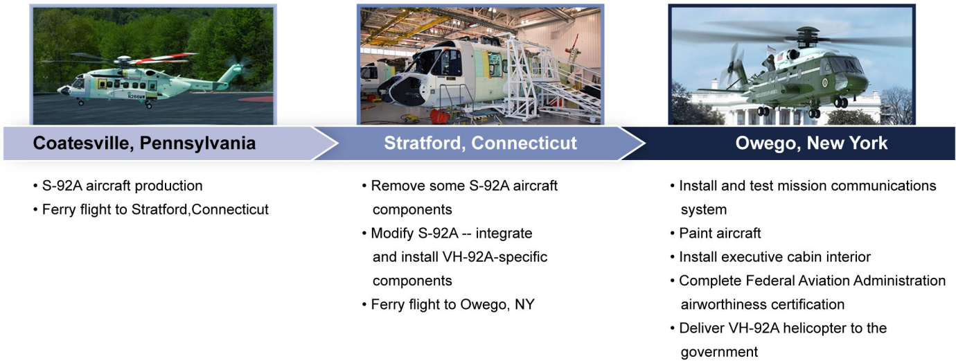
Figure 1: Modification of the S-92A Commercial Helicopter to the VH-92A

Source: © 2016 Sikorsky Aircraft Corporation, a Lockheed Martin Company (photos); GAO analysis of Navy program office information. | GAO-19-329