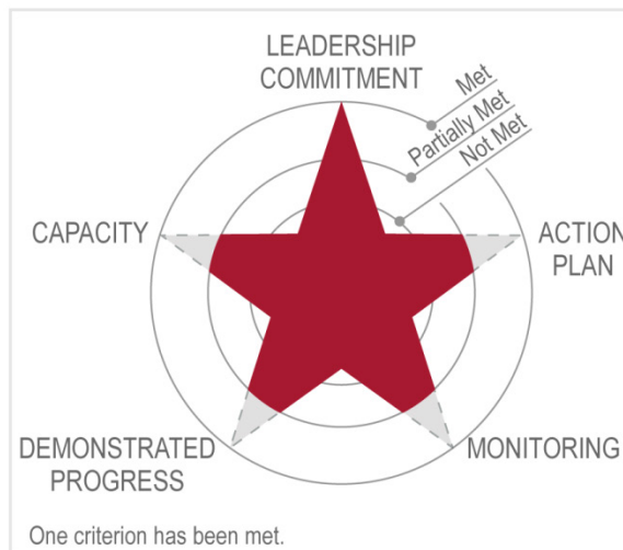
Figure 3: Status of High-Risk Area for Ensuring the Security of Federal Information Systems and Cyber Critical Infrastructure and Protecting the Privacy of Personally Identifiable Information, as of February 2017

As we reported in the February 2017 high-risk report, 21 the federal government's efforts to address information security deficiencies had fully met one of the five criteria for removal from the High-Risk List—leadership commitment—and partially met the other four, as shown in figure 3. We plan to update our assessment of this high-risk area against the five criteria in February 2019.