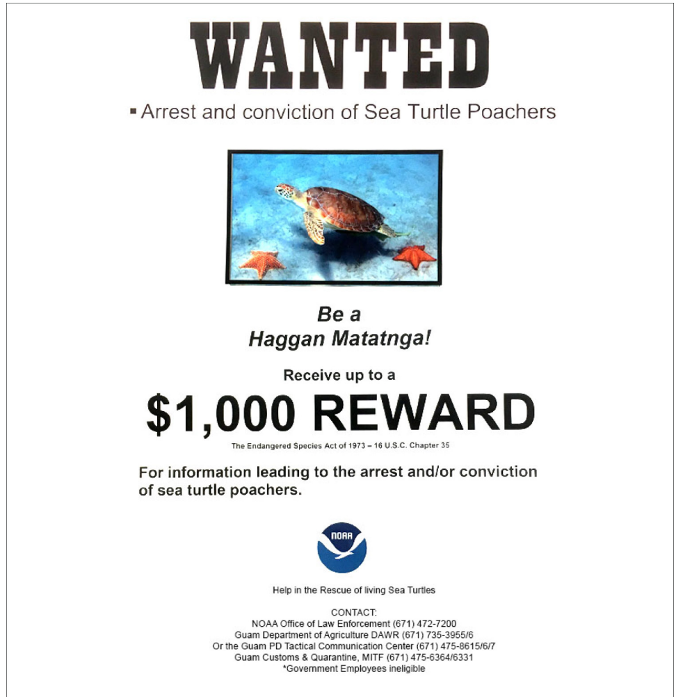
Figure 2: National Oceanic and Atmospheric Administration (NOAA) Poster Advertising a $1,000 Financial Reward in 2017 for Information on Sea Turtle Poachers in Guam

Source: National Oceanic and Atmospheric Administration. | GAO-18-279