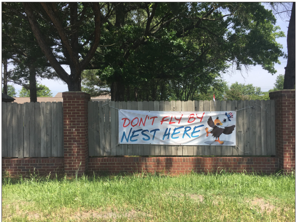
Figure 2: Advertisement Seeking Tenants for Privatized Housing

or offering rent concessions. While these actions can increase occupancy, advertising adds costs to project operations, and rent concessions lower the per-unit revenue earned for the project. Figure 2 shows an advertisement by a privatized housing project seeking tenants outside of Naval Station Norfolk in Virginia.