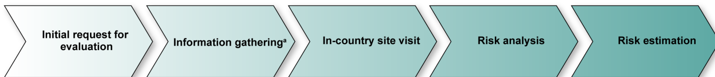
Figure 2: Animal and Plant Health Inspection Service's (APHIS) General Process for Evaluating a Foreign Country's Animal Health System

GAO-17-373