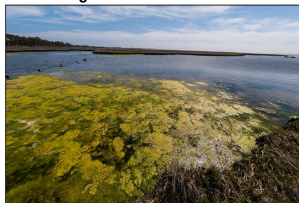
An algal bloom appears on the water's surface at Assateague Island National Seashore, Maryland.