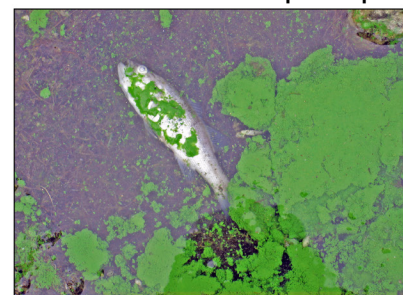
A cyanobacteria (also called blue-green algae) bloom on Binder Lake, Iowa, caused a fish kill.

GAO-17-119