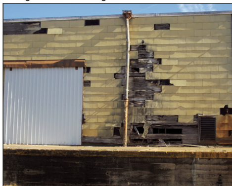
GSA: Warehouse with exterior damage.