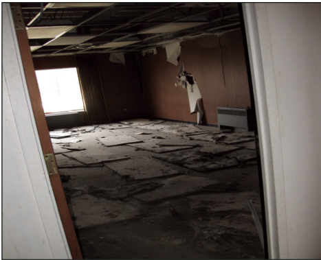
GSA: Old firehouse with collapsed ceilings.