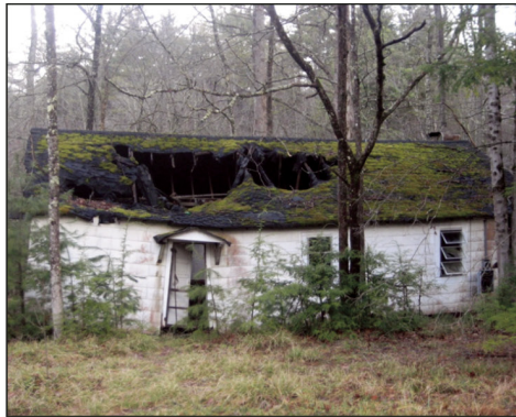
Interior: Cabin with collapsed roof.