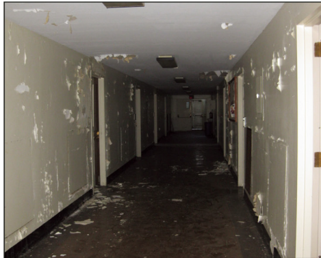
USDA: Mostly vacant laboratory building with ceiling and wall damage.