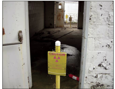
DOE: Warehouse with radiological contamination.