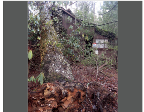
Interior: Cabin with large tree that has fallen through the roof.