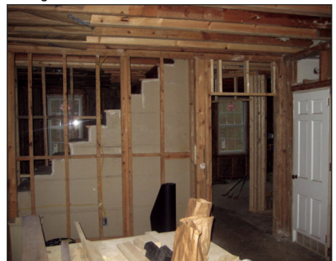
Interior: Building under renovation.