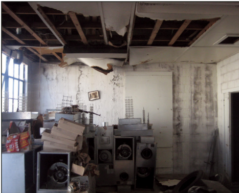
GSA: Warehouse with a collapsing ceiling.