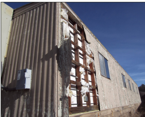
USDA: Vacant trailer with safety and health issues (rat and beehive infestation). Now demolished.