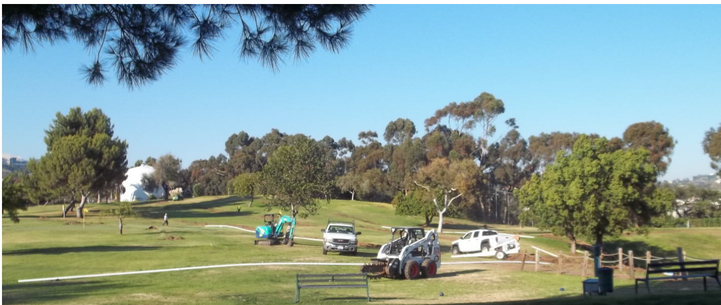
Figure 1: Sharing Partner Installing Irrigation System at Golf Course without Prior Approval