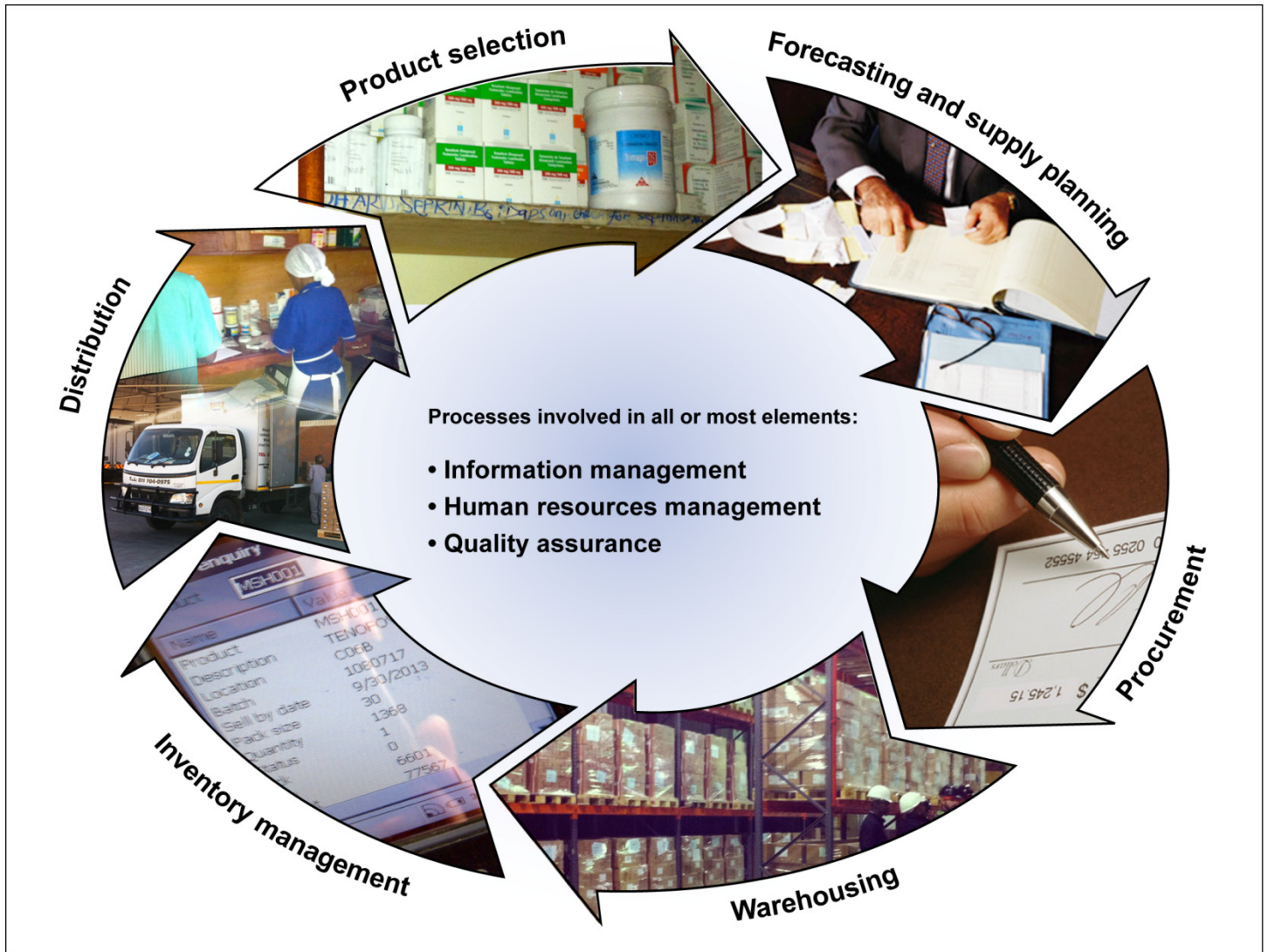
Figure 1: Elements of a Health Care Drug Supply Chain