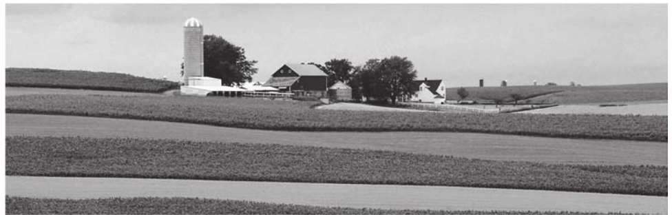
Figure 1: Strip Cropping to Reduce Soil Erosion