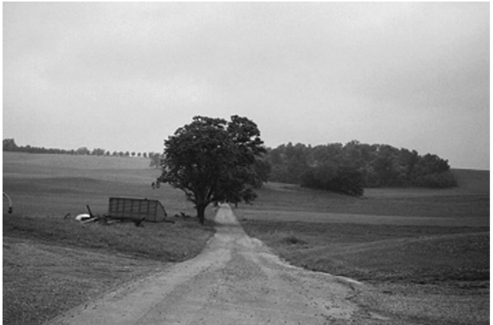
Figure 2: Road Near Hagerstown, Maryland, That Divides a “Rural” Area” from a “Nonrural” Area, 2004

with a city or urbanized area that has a population of at least 50,000, are not intended to be urban-rural classifications and can contain both urban and rural areas. We suggested that changes to this requirement, such as using density measures rather than the MSA criterion, might allow USDA to better differentiate between urban and rural areas (GAO-05-110). In addition to our suggested alternative, Congress incorporated into the 2008 Farm Bill a requirement that USDA report on the various program definitions of “rural.” USDA has not yet issued such a report. However, according to agency officials, USDA recently provided training to field staff to help address concerns about inconsistent eligibility determinations for rural areas.