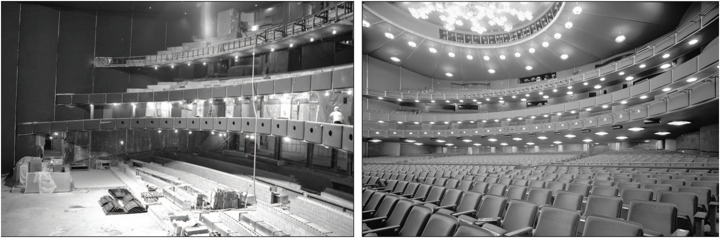
Figure 2: Kennedy Center Opera House during and after Renovation