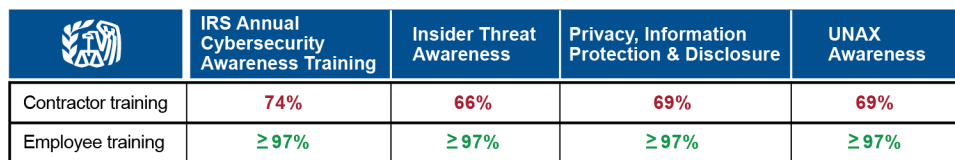
Figure 3: IRS Contractor and Employee Training Completion Rate, Fiscal Year 2021

Source: GAO analysis of Internal Revenue Service (IRS) Integrated Talent Management System data. | GAO-24-107129