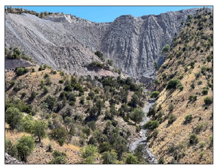
Figure 2: Erosion on the Coronado National Forest in Arizona (May 2022)

mountainside of vegetation that kept the soil in place. According to a Forest Service official, the entire mountainside is in danger of collapse (see fig. 2).