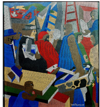
Community, 1989 (Joseph P. Addabbo Federal Building, Queens, NY)