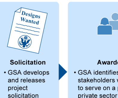
Figure 3: Three Phases of GSA's Design Excellence Program

Design Excellence Manual for all Design Excellence Program projects. The key requirements for each phase are discussed below (see fig. 3).<sup>24</sup>