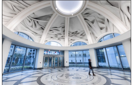
The Robes of Justitia, 2021 (Fred D. Thompson Federal Building and US Courthouse, Nashville, TN)

GAO-23-106139