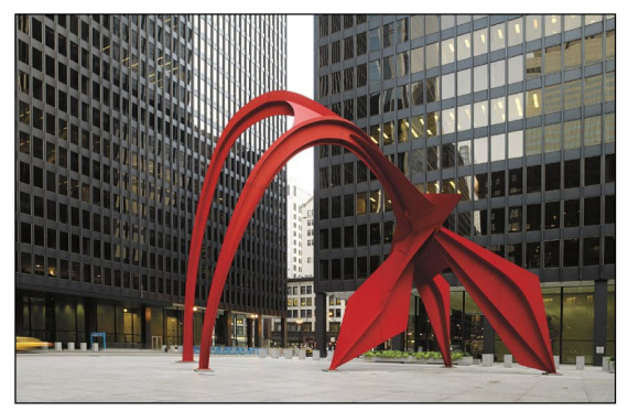
Flamingo, 1974 (John C. Kluczynski Federal Building, Chicago, IL)

Source: General Services Administration. | GAO-23-106139