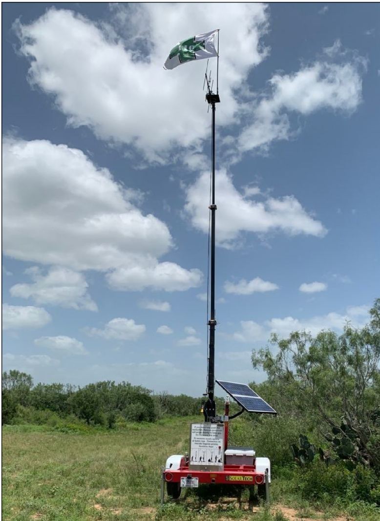
Figure 3: Rescue Beacon and 9-1-1 Placard Deployed Along the Southwest Border

GAO-22-105053