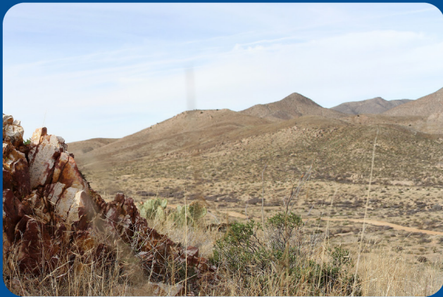
Rocky terrain and desert shrub in New Mexico