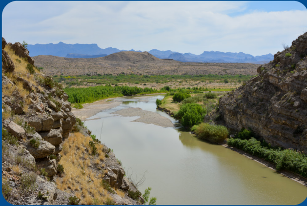
Remote and rugged mountainous terrain and border river areas, which include thick vegetation, in Texas