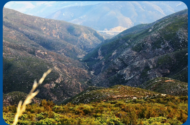
Hilly terrain with dense vegetation in California

GAO-22-105053