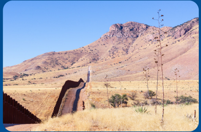
Mountain ranges and valleys along the border in Arizona