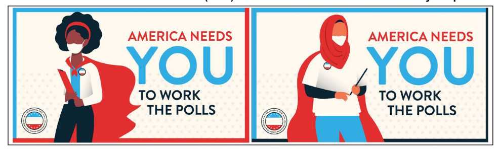
U.S. Election Assistance Commission (EAC) National Poll Worker Recruitment Day Graphic

The U.S. Election Assistance Commission (EAC)—established to serve as a national clearinghouse of information on election administration, among other responsibilities—shared information on a range of topics to help state and local election officials conduct elections during the COVID-19 pandemic. For example, it shared information on in-person voting, absentee/mail voting, and contingency planning. It also established National Poll Worker Recruitment Day and developed graphics as part of a related public awareness campaign (see fig.).