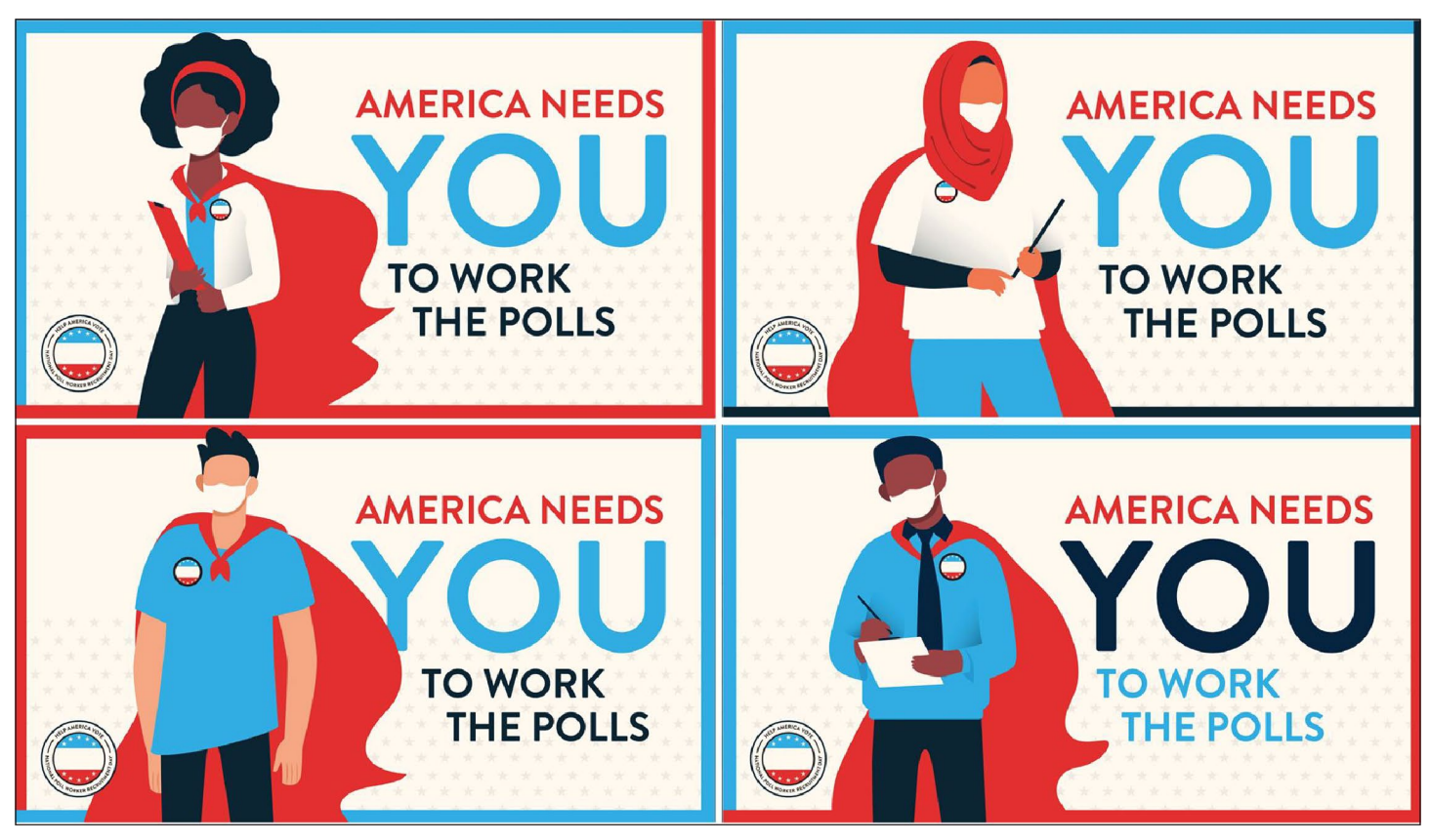
Figure 2: U.S. Election Assistance Commission (EAC) National Poll Worker Recruitment Day Graphic

becoming a poll worker. Figure 2 shows a graphic the EAC developed for National Poll Worker Recruitment Day.