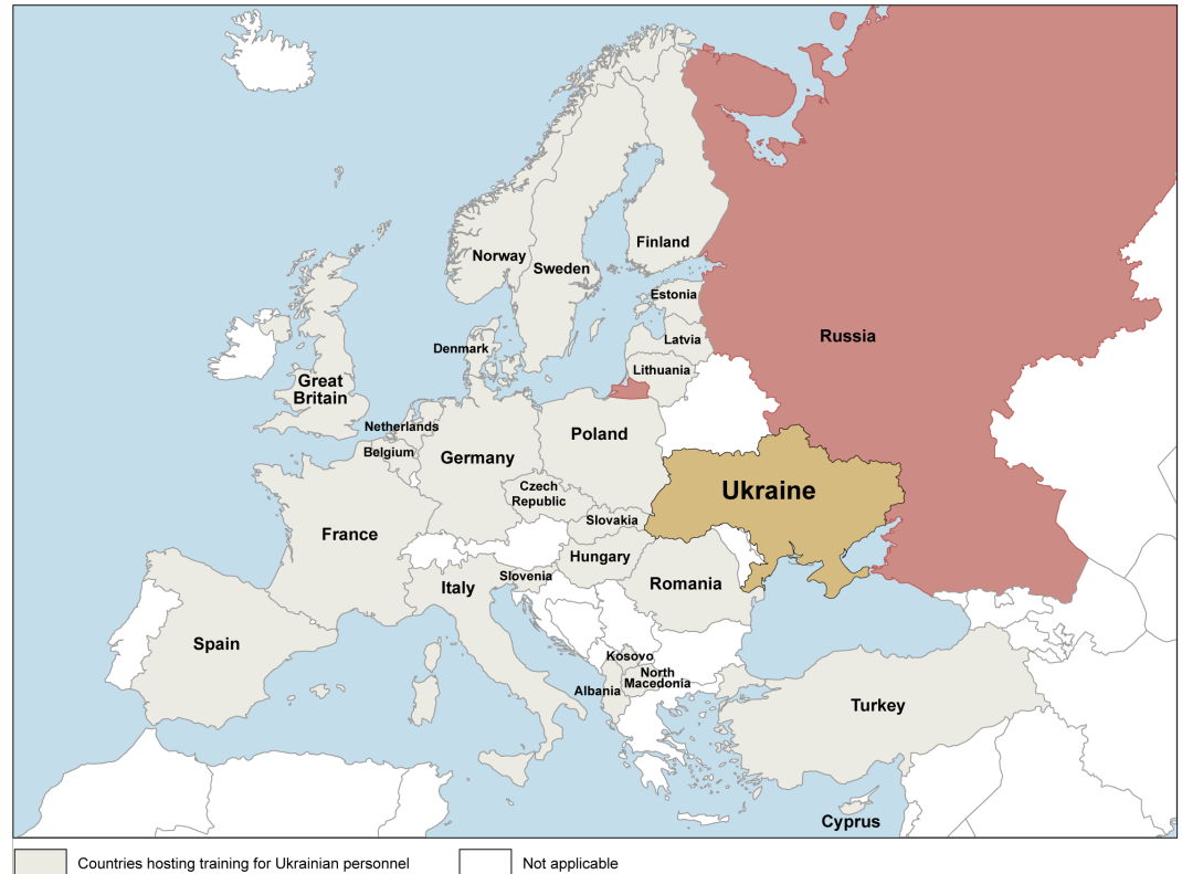
Figure 3: Map of Host Countries Where Ukraine Military Training Has Taken Place, as of February 23, 2024

Source: GAO analysis of Security Assistance Group-Ukraine training data, as of February 23, 2024 (data); Map Art (map). | GAO-24-107776