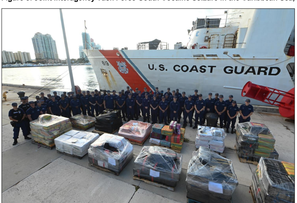
Figure 3: Joint Interagency Task Force-South Cocaine Seizure in the Caribbean Sea, September 2023

In 2019, we reported that the task forces generally coordinated effectively using mechanisms that aligned with leading practices. These mechanisms, such as working groups and liaison officers, helped to minimize duplication of missions and activities. Figure 3 shows a seizure of more than 12,000 pounds of cocaine in the Caribbean Sea in September 2023, which was the result of JIATF-South coordination between Coast Guard, CBP Air and Marine Operations, and international partners.