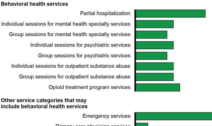
Figure 3: Median Co-payment Amount for Medicare Advantage (MA) Plans for Selected Outpatient Behavioral Health Service Categories, 2024