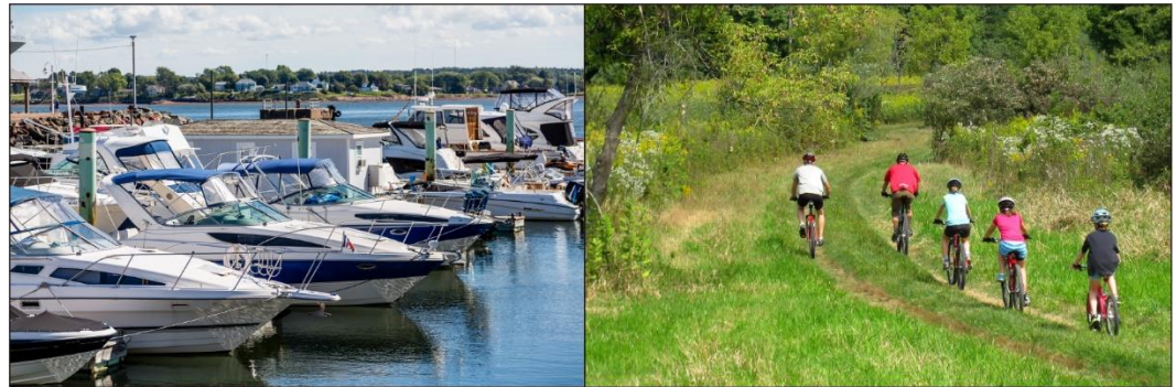
Figure 1: Examples of the Corps' Public Recreation Amenities

GAO-24-107208