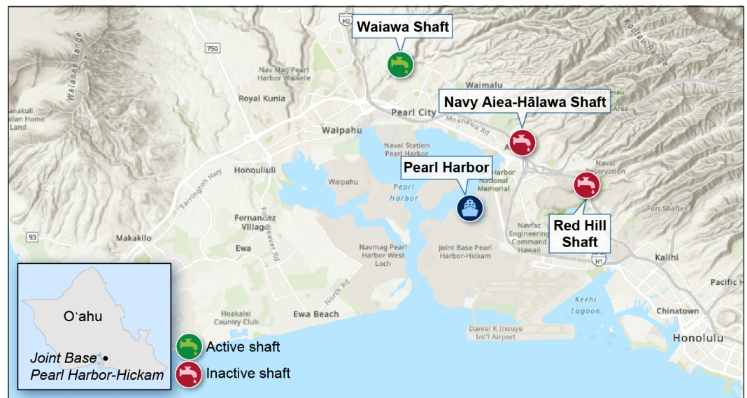
Figure 2: Map of Department of Defense’s Three Drinking Water Shafts at Joint Base Pearl Harbor-Hickam

Sources: Department of Defense (Red Hill); Hawaii Commission on Water Resource Management data (shaft location); Map Resources (O’ahu map); GAO (icons); Esri and its licensors (Pearl Harbor and surrounding area map). The map image of Pearl Harbor and the surrounding area is the intellectual property of Esri and is used herein under license; attribution for the map is as follows: Esri, HERE, Garmin, SafeGraph, METI/NASA, USGS, EPA, USDA, CGIAR. | GAO-24-106812