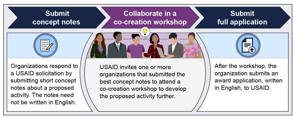
Figure 2: U.S. Agency for International Development (USAID) Application and Co-Creation Process

Sources: GAO summary of USAID information (data); GAO (icons). | GAO-24-106232