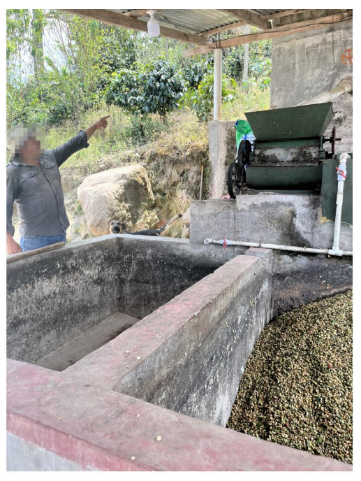
Figure 3: Farmer Demonstrating Coffee-Bean Processing Supported by U.S. Agency for International Development's Centroamérica Local Initiative