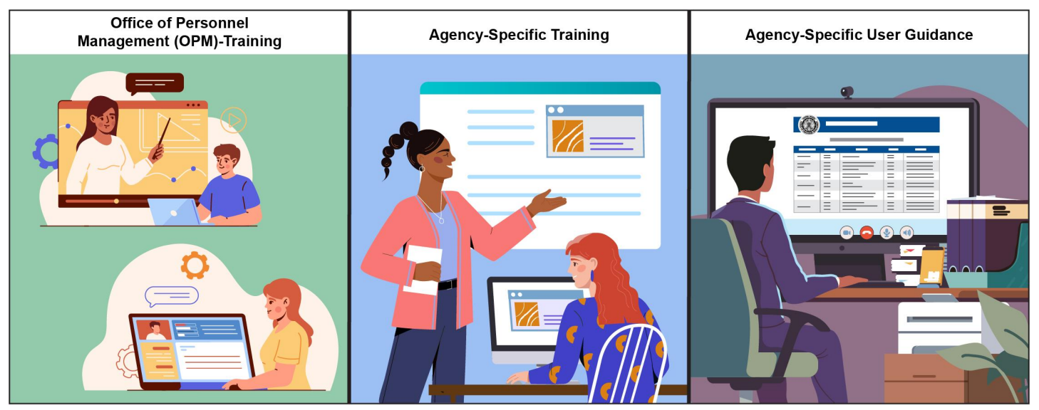
Figure 3: Available USA Staffing Training to Selected Federal Agencies' Human Capital Professionals

Source: GAO review of OPM, Internal Revenue Service, National Aeronautics and Space Administration, and National Park Service training. Rudzhan/iconicbestiary/stock.adobe.com; (illustrations). | GAO-24-105738