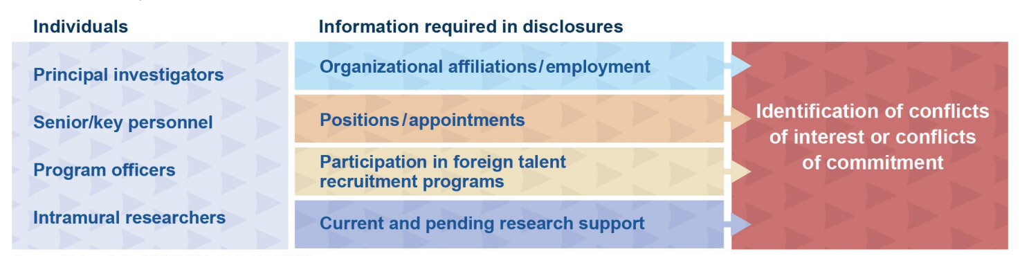
Figure 1: Overview of Disclosure Requirements for Participants in the Research and Development Enterprise as Specified in National Security Presidential Memorandum-33 (NSPM-33) and Implementation Guidance

Source: GAO analysis of NSPM-33. | GAO-24-106074