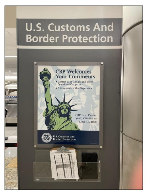
Figure 2: U.S. Customs and Border Protection (CBP) Information Center Posters Located at an Air Port of Entry