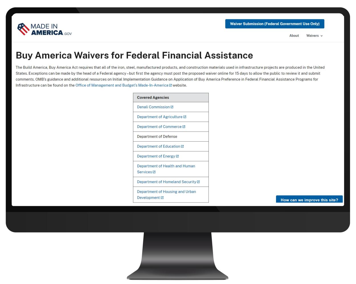
Figure 1: Madeinamerica.gov Webpage Showing Links to Agency Websites

GAO-24-106166